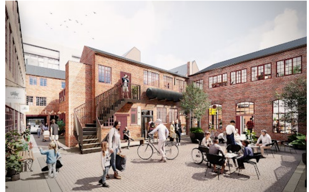
Leah's Yard – Heart of the City Space for community, independent local businesses, social entrepreneurs & makers